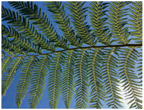
TIP FROM CLEEVE NURSERY

Move plants in pots together so that they protect one another in cold weather. Remove saucers from underneath them and ensure excess water can get away through the drainage holes in the base by standing them on pot feet.