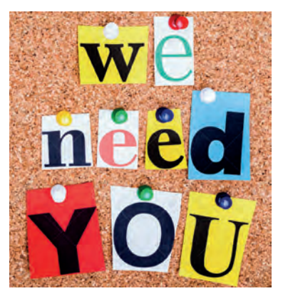
YOUR VILLAGE HALL NEEDS YOU!

If you feel you could help and give a small amount of time each week to our village hall we are looking for a treasurer. The current incumbent needs to devote more time to his day job so we are looking for a replacement